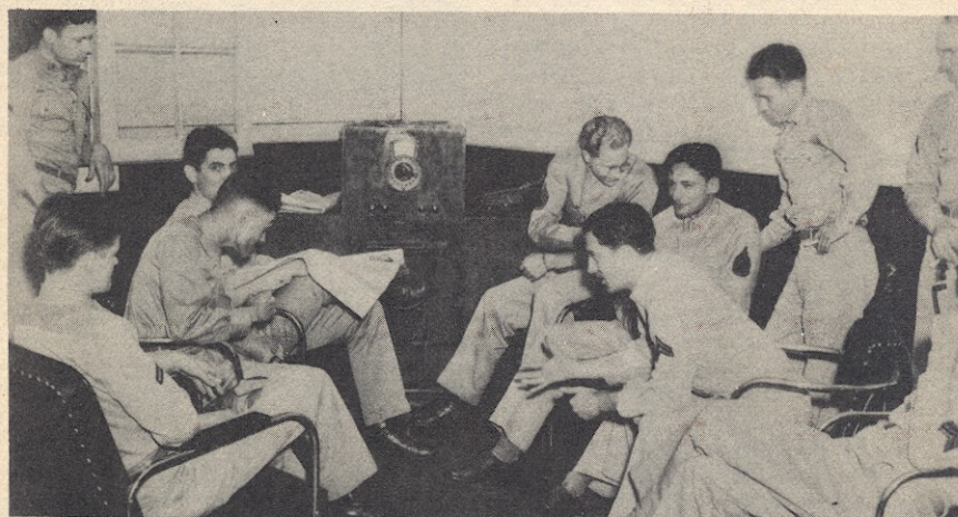
Men of the U.S. Army Signal Corps, "Somewhere in Iceland," listening in their day room to a rebroadcast of a football game from home.

COMPLETE GUIDE-BOOK FOR SHORT-WAVE LISTENERS