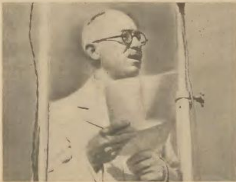
Listeners to OLR recently heard the President of Czechoslovakia, Dr. Edward Benes, speaking in connection with the present European crisis

SHORT-WAVE SHORTS: T14NRH (9.7), Heredia, Costa Rica, is now using the Costa Rican national anthem as a sign-on and sign-off signature. . . . COCH (11.73) of Havana, Cuba, will leave the air temporarily while a new 20,000-watt transmitter is being installed. . . . CJCX (8.01) of Sydney, Nova Scotia, Canada, with a power of 1,000 watts, transmits on Sundays only, from 11 p.m. to 12:30 a.m. EDT. . . . LZA, Sofia, Bulgaria, is being reported on dual frequencies of 14.96 and 15.18 megs, according to listeners in Arizona and California, who are hearing broadcasts from 10 to 11 a.m. and midnight to 1 a.m. EDT, almost daily.