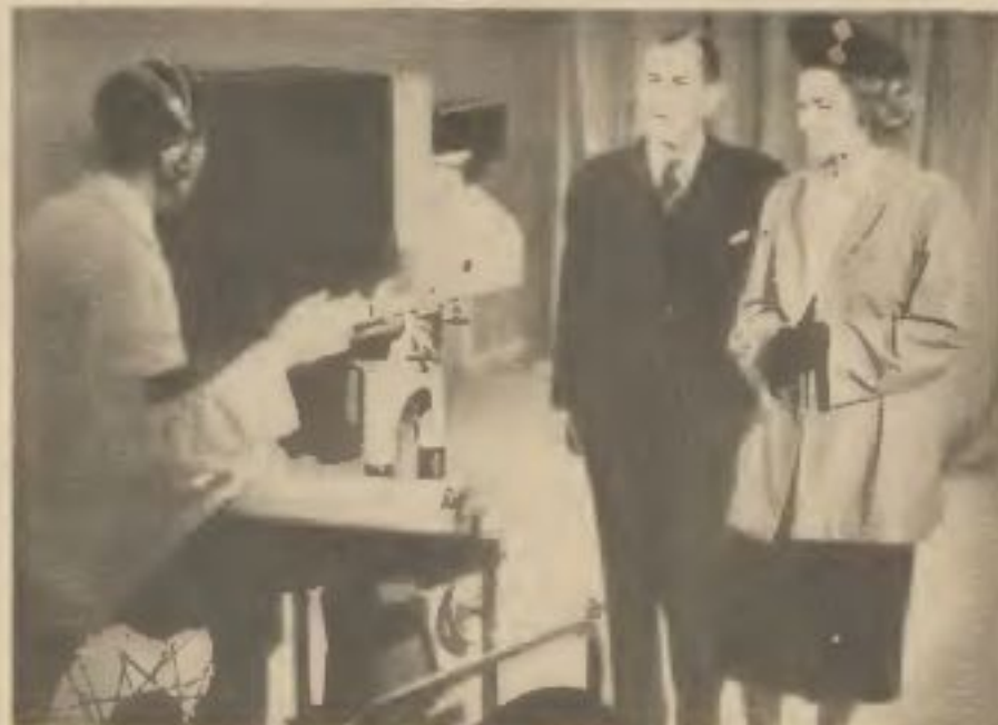
Anna Neagle, star of “Victoria the Great,” and Herbert Wilcox, who directed the film, before the BBC television camera at Alexander Palace, London. Listeners recently heard Miss Neagle in a broadcast from Daventry