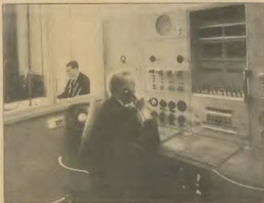
Listeners to HBH (18.48), Switzerland, may hear League of Nations broadcast Sunday morning at 10:45 a.m. EST. Above: View of the recently finished control-room in the League of Nations Palace

Key to Symbols Used: *Daily; †Week Days; ‡Monday, Wednesday, Friday; §Monday, Thursday; ¶Monday, Friday; ††Tuesday, Thursday, Saturday; †††Wednesday, Saturday.