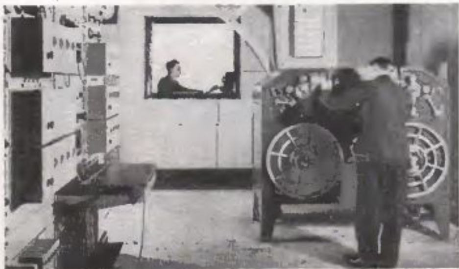
Recording-room in the BBC's auxiliary studios at Maida Vale, London, in which many of the Empire programs are electrically recorded. Engineer (right) is adjusting a recording, while the one at left controls volume

Heroic deeds of mountaineers and mountaineering enthusiasts will be the featured presentation on the American Hour from Rome, over Short-Wave Stations ZRO3 (9.635), IRF (9.83), and IQY (11.9), on Thursday, March 10, at approximately 8:15 p.m. EST.