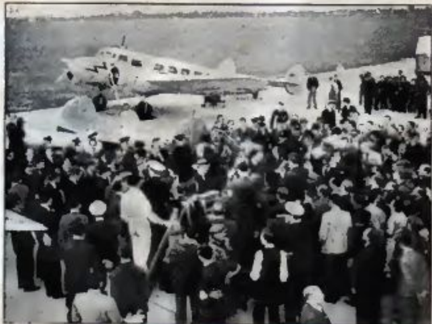
Televising the return of the Rt. Hon. Neville Chamberlain from his first meeting with Herr Hitler at Berchtesgaden. Mr. Chamberlain can be seen in the center of the crowd (just behind the step ladder)