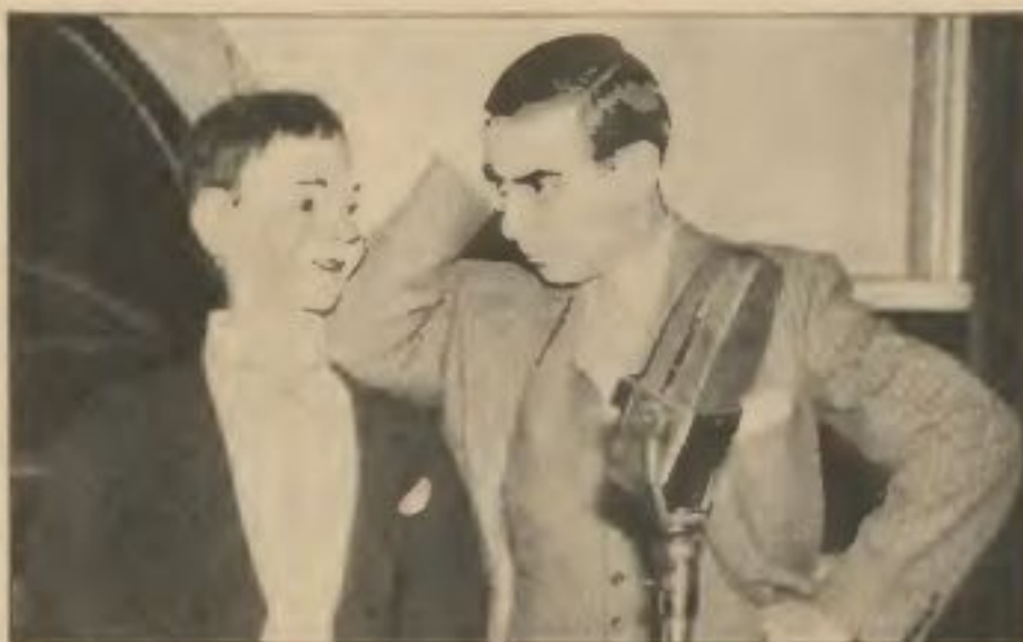
On his recent visit to England Eddie Cantor "met" the British Broadcasting Corporation imitation of Charlie McCarthy. Named "Willie Winkett," it had its air debut on "Sing Song," a BBC variety program begun recently