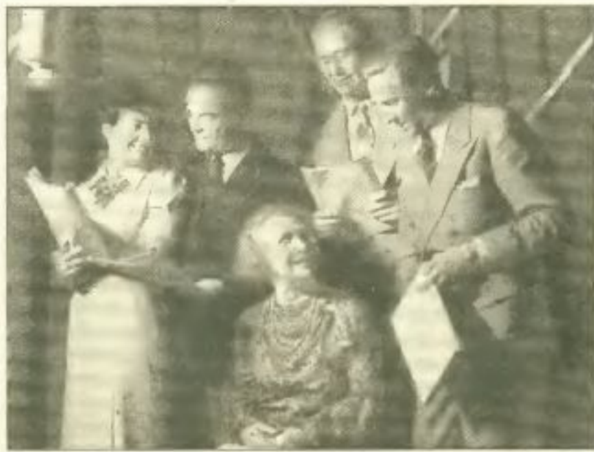
"The Schmidts at Home," fortnightly broadcast of the German Short-Wave Stations DJB and DJD, may be heard this week on Friday, at 8:30 p.m. EST. Above: Well-known actors who make up the cast