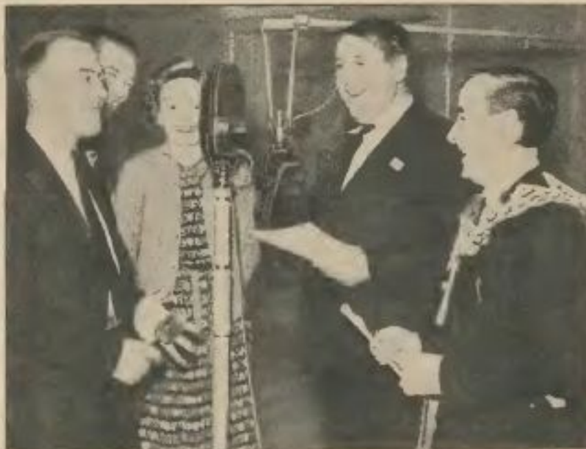
Charles Laughton, famous for his portrayal of Captain Bligh in "Mutiny on the Bounty," played the part of a busker (street musician) in a recent program from Daventry. He's seen fourth from the left

WIXAL, the University Club station at Boston, Mass., is now operating as follows: On 15.25 megs, week-days except Saturdays from 2 to 3:30 or 4 p.m.; on 15.13 megs, Sundays from 10 a.m. to 1 p.m.; on 11.79 megs, Mondays, Wednesdays and Fridays from 4:55 to 6:30 p.m., Tuesdays and Thursdays from 4:40 to 6:30 p.m., Saturdays from 1:45 to 6 p.m., and Sundays from 3 to 6:30 p.m.; on 11.73 megs, week-days except Saturdays from 9:15 to 11:30 p.m., and on 6.04 megs, daily except Saturdays from 7 to 8:30 or 9 p.m. EST.