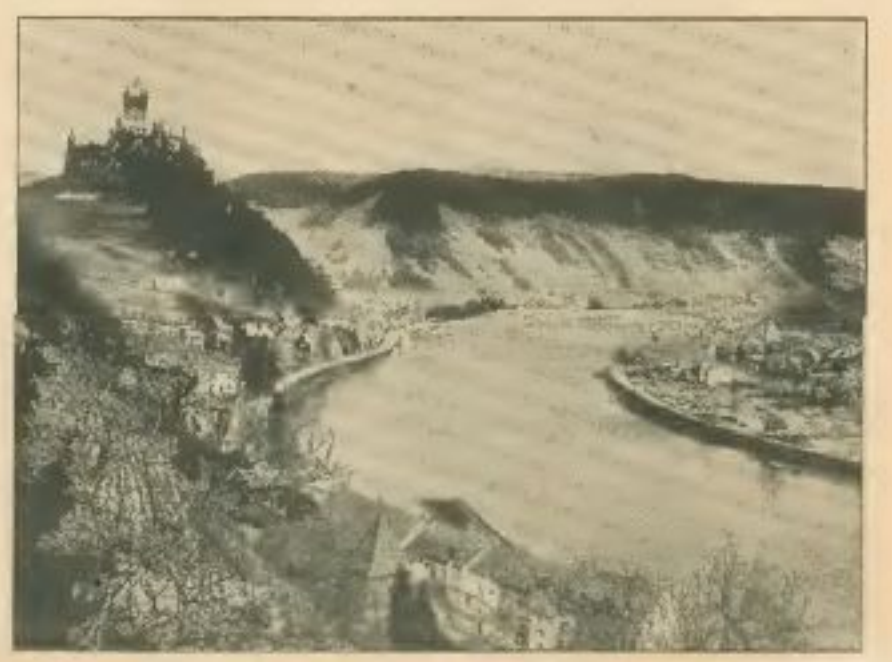
Listeners to the German short-wave stations DJB and DJD will hear a dramatization of the history of Cochem Castle on the Mosel (above), Monday at 5 p.m. EST, 4 p.m. CST, 3 p.m. MST, 2 p.m. PST