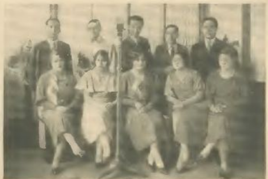
Listeners to Station PRADO (6.625), South America, hear these Ecuadorian artists in a program of romantic music each Thursday at 9 p.m. EST