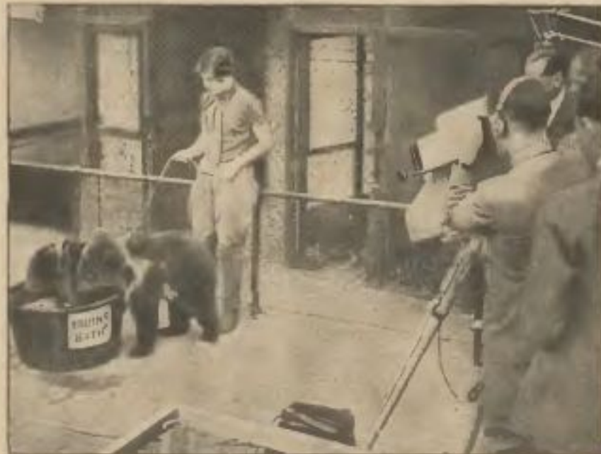
Animal and bird noises are recorded at the Zoo for "Animal Snap," a guessing game, soon to be broadcast to all Daventry listeners

PK8XX (14.02), base-camp station of the Archbold Expedition of the American Museum of Natural History at Hollandia, New Guinea, is being heard many mornings between 6 and 9 a.m. EDT. PK8XX contacts Amateur Station W6NRR on Saturday mornings at 3 a.m. EDT. The advance party of explorers now carrying out scientific research in the interior carry on communications with the base-camp station by means of their aircraft transmitter, which operates on 6.21 and 11.325 meg.