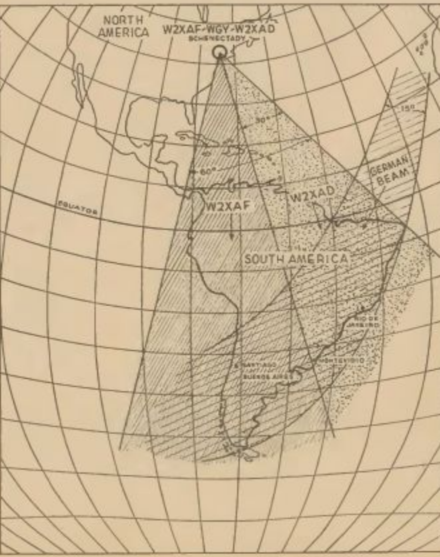
The South American beams of short-wave stations W2XAD (covering Brazil) and W2XAF (covering the western portion of South America) are being used to counteract German propaganda beamed on Latin countries