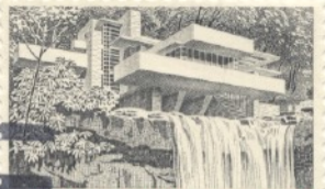
Frank Lloyd Wright 1867-1959 Fallingwater Mill Run PA Architecture USA 20c

U. S. NAVY DEC 6 1983 FPD 96692 MCM ANTARCTICA