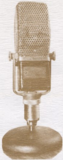
50 años Emisora H.J.C.K.