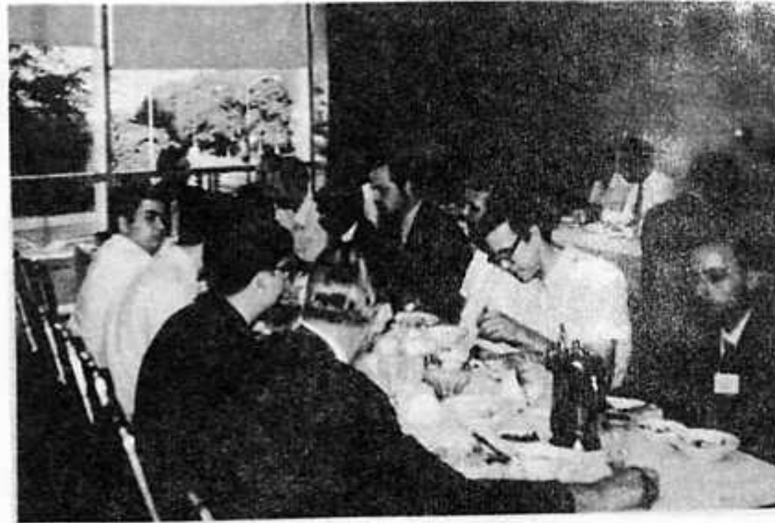
ANARC BANQUET 1970