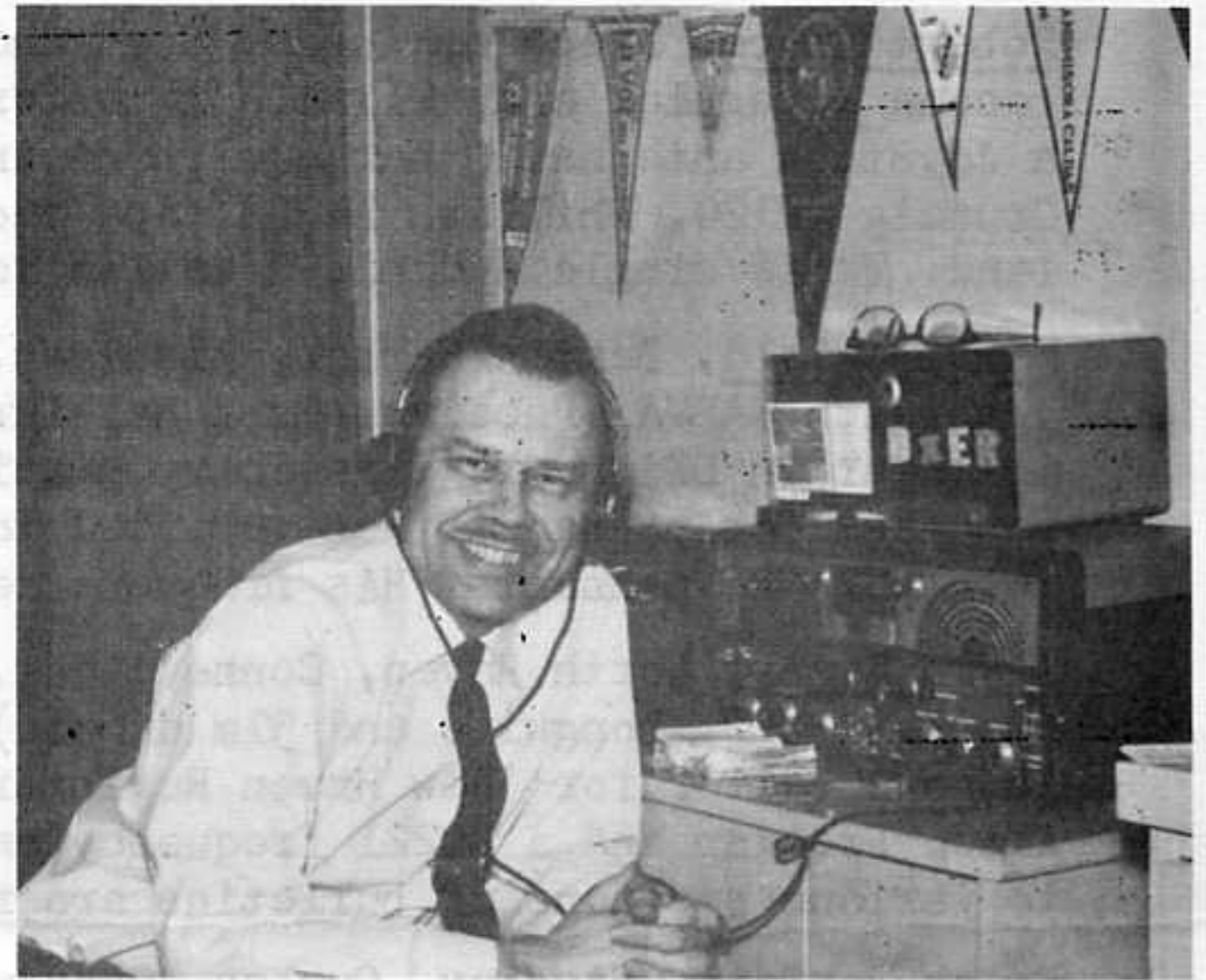
Marlin Field, Michigan