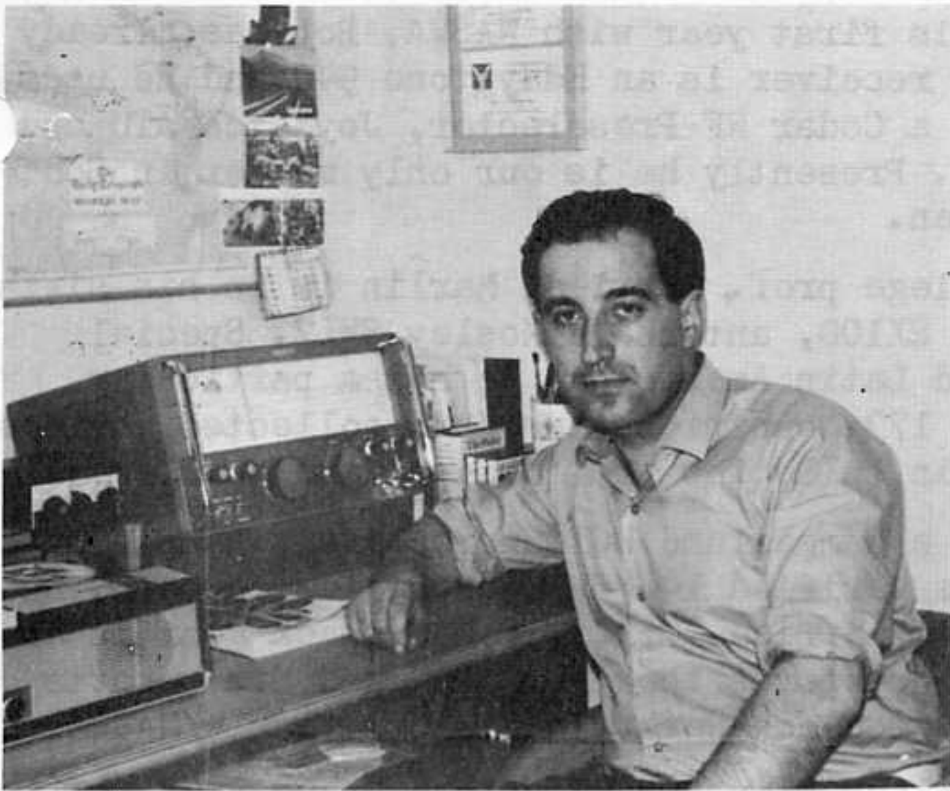
Robert Bruce, Scotland