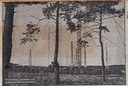
Here we have a glimpse of the Antennae system of "Deutschen Kurswellensenders" Station in Zeesen, Germany