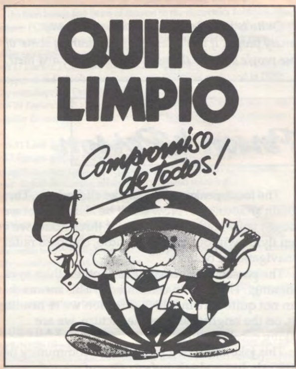
"Quito Limpio—Compromiso de Todos" is seen in many places throughout the city. It translates to English as "A Clean Quito—Commitment of Everyone."

Recently more than 5,000 students followed Evaristo's advice on keeping the city clean. Students from 35 Quito elementary schools and high schools participated in a massive clean-up