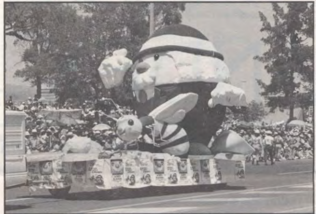
Evaristo is seen almost everywhere from boulevard billboards to bags of milk. He's shown here as a parade float. He is also a familiar fellow to the television screen.

thoughts on life why not tune in to Studio 9 during the week April 19 through 23. HCJB will air some interviews with Quiteños.