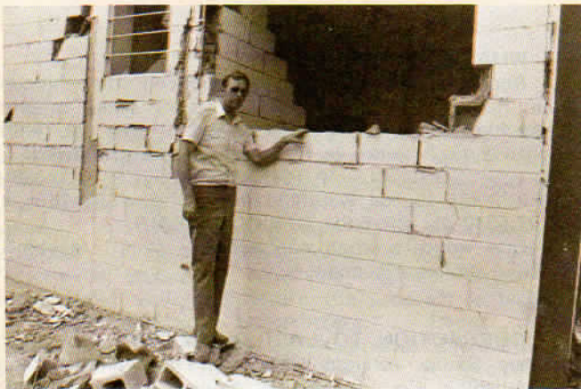
Quake damage to Radio Station HCRI, Santa Rosa