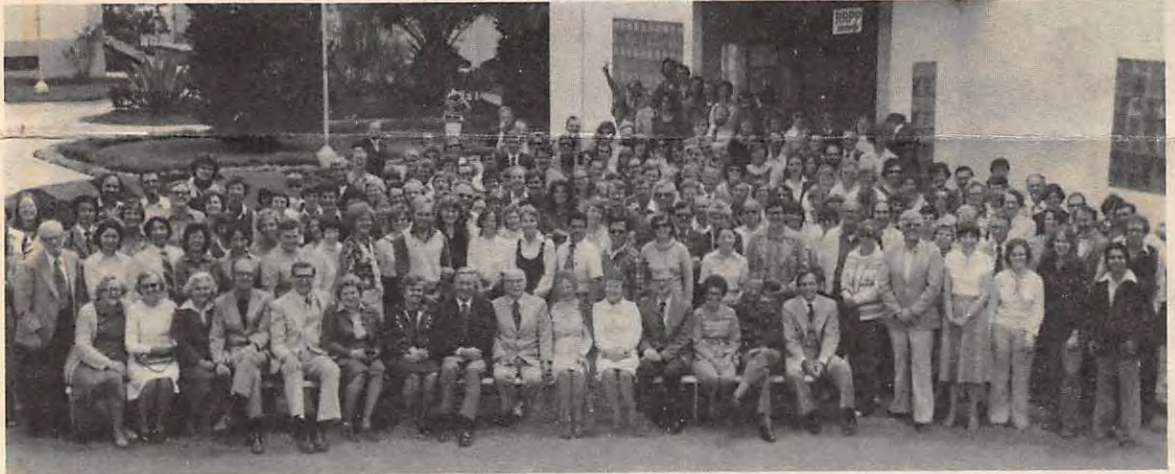
Merry Christmas from HCJB's missionary staff

Anniversaries are happy times. In Ecuador, and at HCJB, December is a month of anniversaries. Let us list four special events that take place during this month.