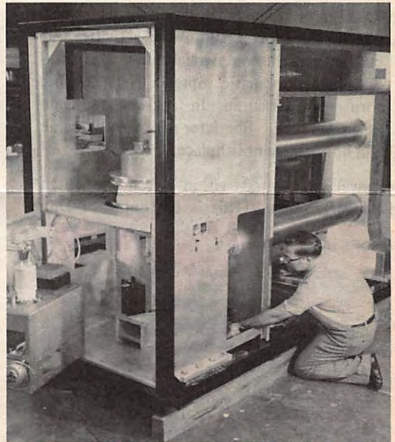
Soon a 500 kW transmitter will be on the air

In honor of all these special days in December, we are including a number of historical pictures of HCJB and its continual growth.