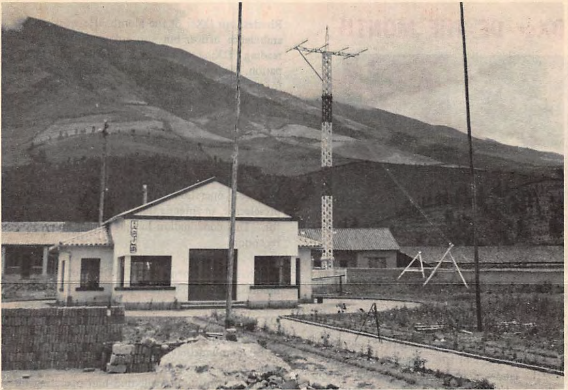
New transmitter building inaugurated in 1940