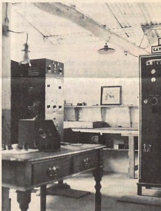
Transmitter used during early 1930s