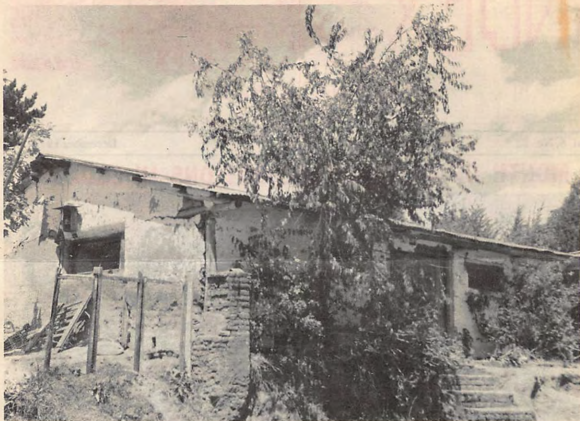
Programs began in 1931 from this converted sheep shed