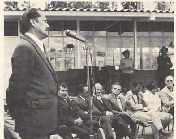
Ecuadorian dignitary at school inauguration

HCJB is interested in people — their needs, hopes and ambitions.