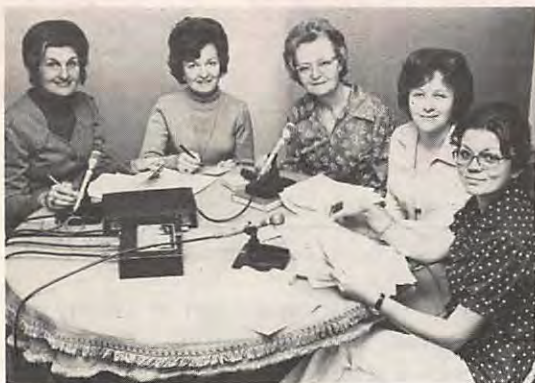
Broadcasting in Russian