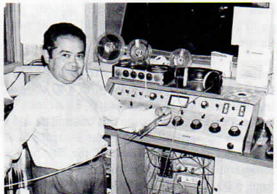
Gran Colombia Control

Among the older stations operating in Quito is Emisoras Gran Colombia, HCMJ1. During September of 1974 they will celebrate 30 years on the air serving Quito and Ecuador. Actually, Emisoras Gran Colombia consists of a network of stations all broadcasting in Quito. These include Emisoras Gran Colombia (615 kHz), Radio El Tiempo (1410 kHz), Radio La Voz de la Democracia (1280 kHz), Emisoras Gran Colombia (4.910 MHz) and Radio Estereo FM (91.3 MHz). All of these stations transmit from a complex of studios on the fourth floor of a building in down-