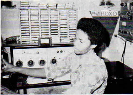
HOXO Control Room

The Isthmus of Panama not only links two great oceans but also the two American continents. About 40 ships from all parts of the world make the transit between the Pacific and the Atlantic Oceans each day. Most of the air travel between the Americas passes through this narrow strip of land. Panama is certainly worthy of the titles it has been given, "Bridge of the Americas" and "Crossroads of the World."