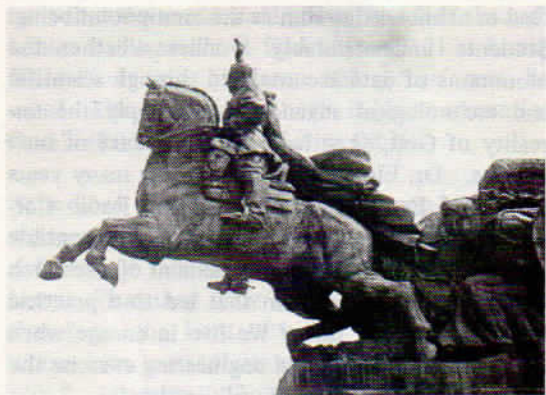
Simón Bolívar Statue

During the month of July, people in all parts of Latin America remember the birth of the greatest hero in the history of these countries. Simón Bolívar, often called "The George Washington of South America", was born in Caracas, Venezuela, on July 24th, 1783. The great drive of his life was to free Latin America from Spanish rule, create independent republics and unite them in a strong federation. His efforts in behalf of the independence of the struggling South American republics also won for him the title of "El Libertador" or "The Liberator."