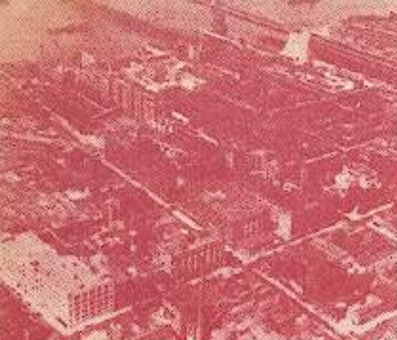
RCA Mfg. Co., Inc., Camden, N.J., U.S.A. RADIO HEADQUARTERS