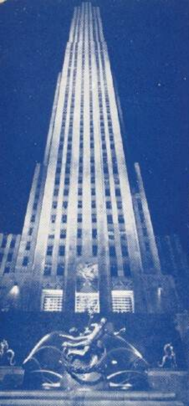
RCA BUILDING - RADIO CITY - NEW YORK