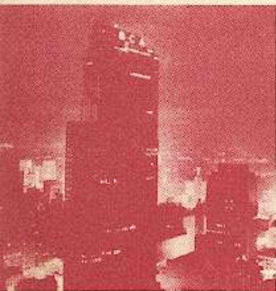
RCA BUILDING—New York City BROADCASTING HEADQUARTERS